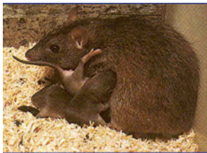
Female Rat and Young