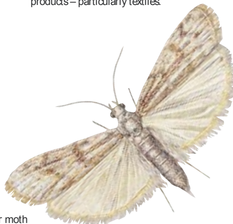
Mediterranean flour moth 22mm wingspan

Moths can be found in a variety of stored products. Some species are associated with goods of vegetable origin, to which they may be adapted with varying degrees of specificity, whilst others are associated with animal products – particularly textiles.